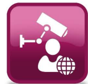
Visual Door Control