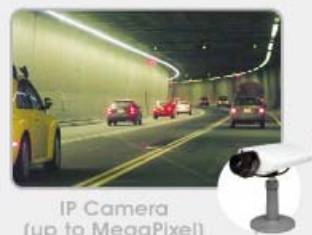
IP Camera (up to MegaPixel)