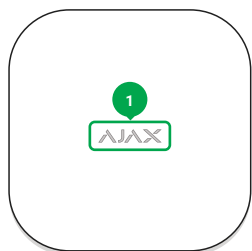
1 - Logo with a light indicator