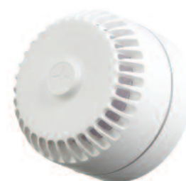
RoLP Maxi White