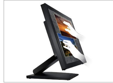
Integration of 10-point touch and projected capacitive touch technology provides accurate and precise touch experience