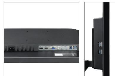
Versatile connectivity: VGA, HDMI, DisplayPort and USB port allow for effortless system integration