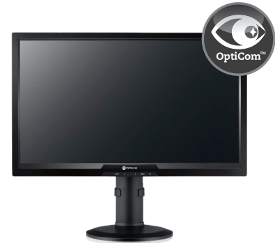
Advanced OptiCom™ Technology: Anti-blue light and flicker free for a more comfortable viewing experience