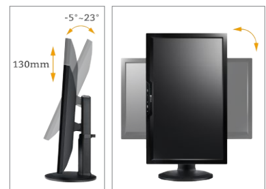
Ergonomically-designed stand allows users to tilt, pivot, swivel and adjust the height to its ideal position