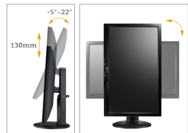
Ergonomically-designed stand allows users to tilt, pivot, swivel and adjust the height to its ideal position