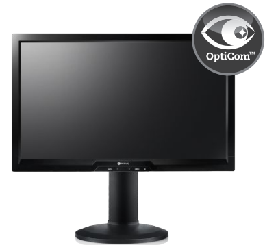
Advanced OptiCom™ Technology: Anti-blue light and flicker free for a more comfortable viewing experience