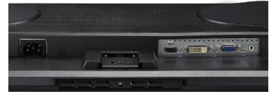
Built-in HDMI input makes the LE-24 easy to be paired with Full HD multimedia advices