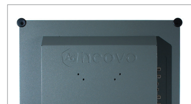
Durable metal casing for enhanced strength and secure mounting