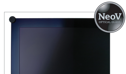
NeoV™ Optical Glass protects against scratches, impacts and other physical damage