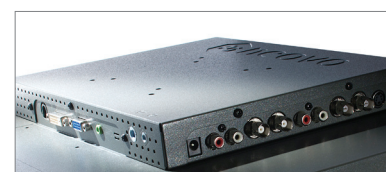
Ultimate video versatility, including passive looping BNC video for multiple display connections