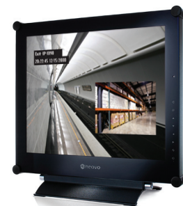
Smart Omni Viewer provides flexible image viewing options such as PIP/PAP, freeze, 180° image rotate