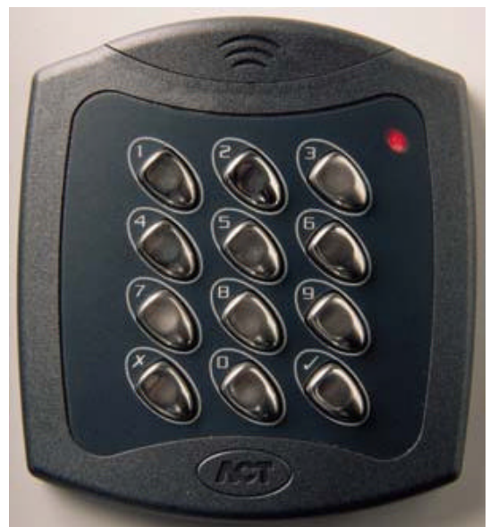
ACT5 DIGITAL KEYPAD