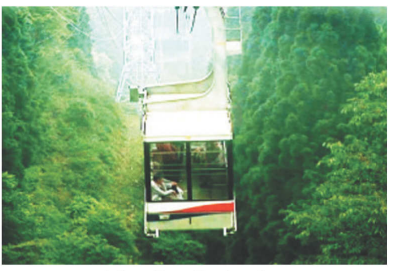
After Fog Reduction